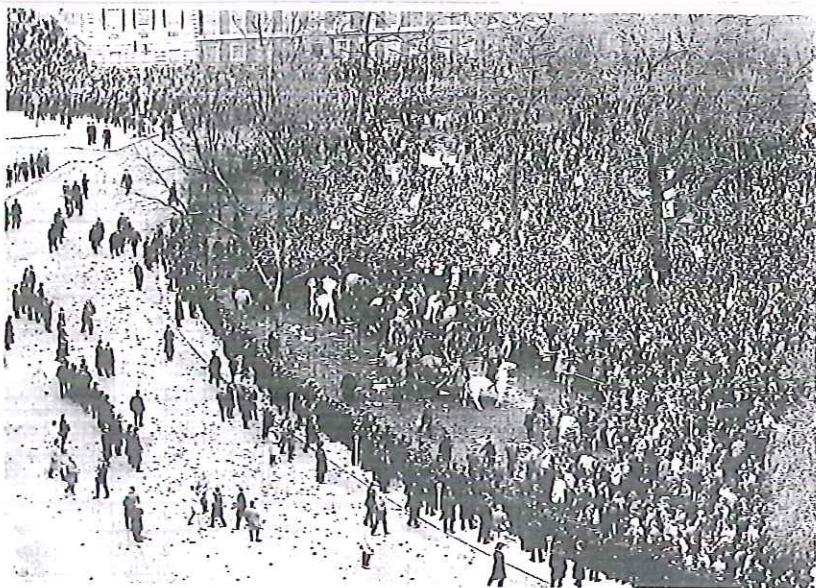
ABOVE Mounted police clash with the demonstrators in Grosvenor Square in March 1968.

Anti Apartheid Movement Banner Books Stop the 70s Tour 'Black Power movement' Irish National Liberation Solidarity Front Operation Omega Socialist Workers Party Workers Revolutionary Party Young Haganah Young Liberals Women's Liberation Front Big Flame Communist Party of England (Marxist-Leninist) Troops Out Movement Anti-Nazi League Direct Action Movement Revolutionary Communist Tendency